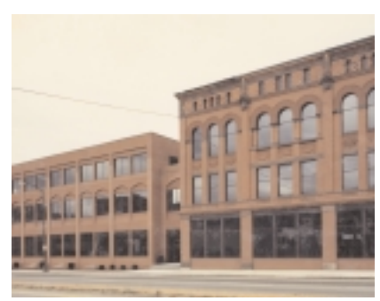
The building on the right was restored by

The Krog Corp. offers its clients unmatched levels of confidence and financial security. Soundly managed and well capitalized, the firm consistently reports a strong cash flow position and maintains a high bonding capacity. Successful financial footing allows The Krog Corp. to work with the most respected clients and undertake some of the most important construction projects in the area. 😺