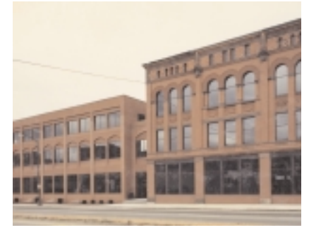
The Krog Corp. and then the second adjacent building was built to complement the original.

In just one example of a dramatic revitalization project in an existing building, The Krog Corp. transformed a long-unoccupied space into a bright and functional loft (below). This project, like all of The Krog Corp.'s undertakings, was completed within budget guidelines and occupied on time.